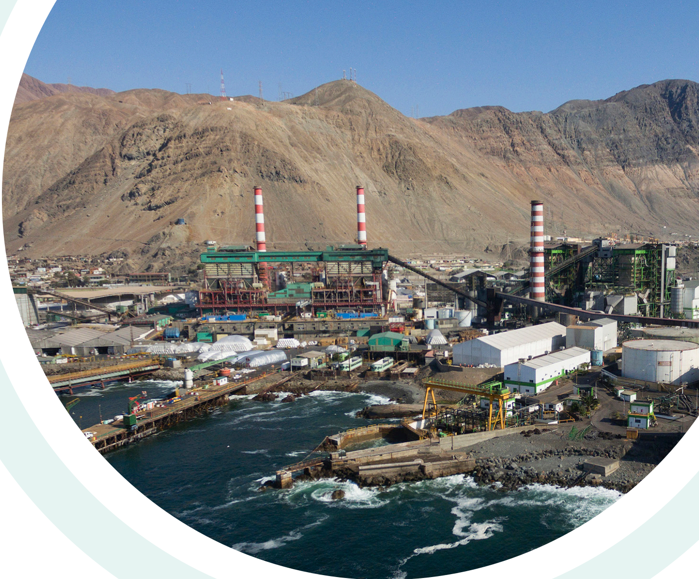
Tocopilla thermal complex