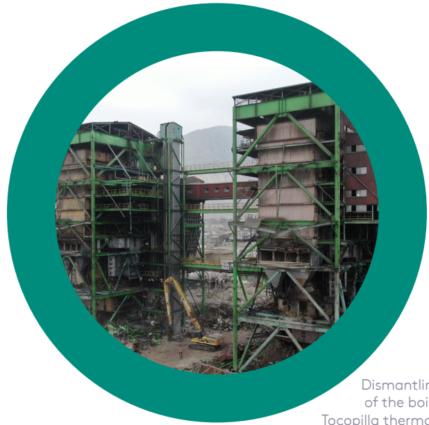
Dismantling process of the boilers at the Tocopilla thermal complex

ENGIE counters that the conversion of its assets “will continue to support the development and [the] local workforce of these cities in the future, which is a fundamental part of our Just Transition strategy”.