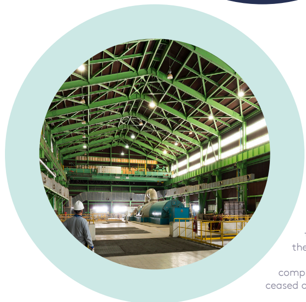
The steam turbine at the Tocopilla thermal complex, which ceased operations in 2022