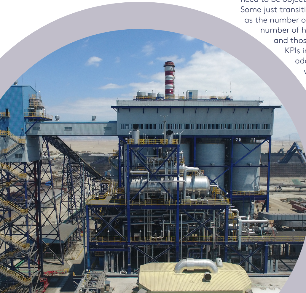
IEM plant within the Mejillones thermal complex

An additional challenge is communicating with investors on relatively complex and ill-defined concepts such as the just transition.