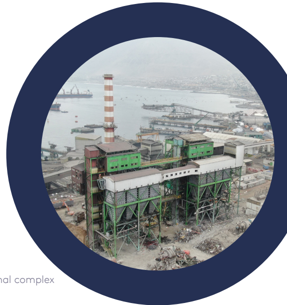
Tocopilla thermal complex