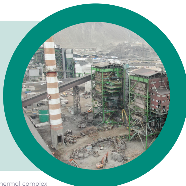
Tocopilla thermal complex

ENGIE Chile has mapped out an aggressive transition away from coal towards renewables, energy storage and natural gas. The utility has worked closely with unions and communities to support affected workers and their families. In a challenging financing environment, it approached the International Finance Corporation and other investors for a green and sustainability-linked loan to support its transition, enhancing social protections for its workers along the way.